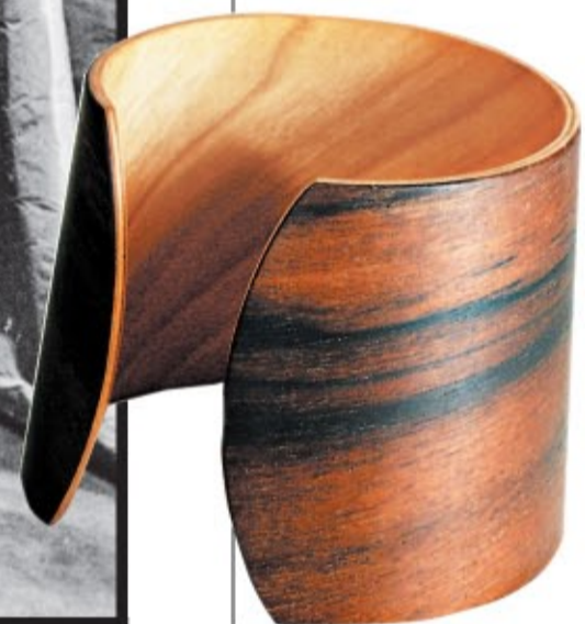
Contexture Design gets cute with the Coffee Cuff ($55.39), a coffee sleeve that doubles as a bracelet.