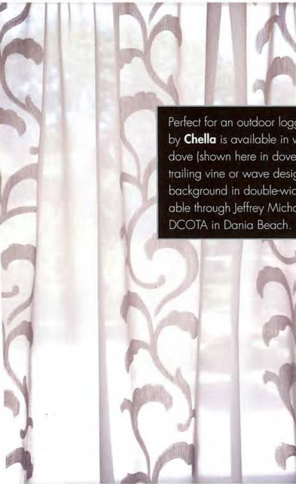
Perfect for an outdoor loggia, Endless Tides by Chella is available in white, sand and dove (shown here in dove), and features a trailing vine or wave design against a sheer background in double-width acrylic. Available through Jeffrey Michaels & Company at DCOTA in Dania Beach.