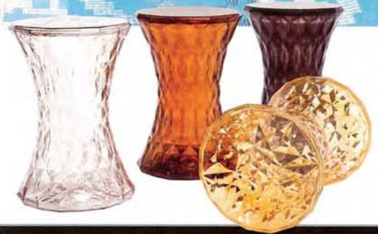
Translucent polycarbonate stone stools by Kartell are available in crystal, smoke, blue, red, yellow and amber. Available at the Kartell flagship store in the Miami Design District.