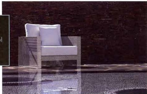
The Detroit line by Baltus Collection includes a chair, sofa, occasional table and folding screen, and features an aluminum frame with fabric or vinyl upholstery for either indoors or out. Available at Baltus Collection in the Miami Design District.

Translucent elements reflect light and water, and provide a cool, subdued contrast in outdoor environments.