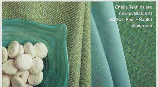
Chella Textiles are now available at ADAC's Paul + Raulet showroom