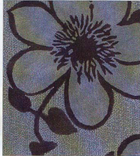
Fleur Passion carpet, at Edward Fields-Tai Ping , DCOTA, Suite B-436, Dania Beach