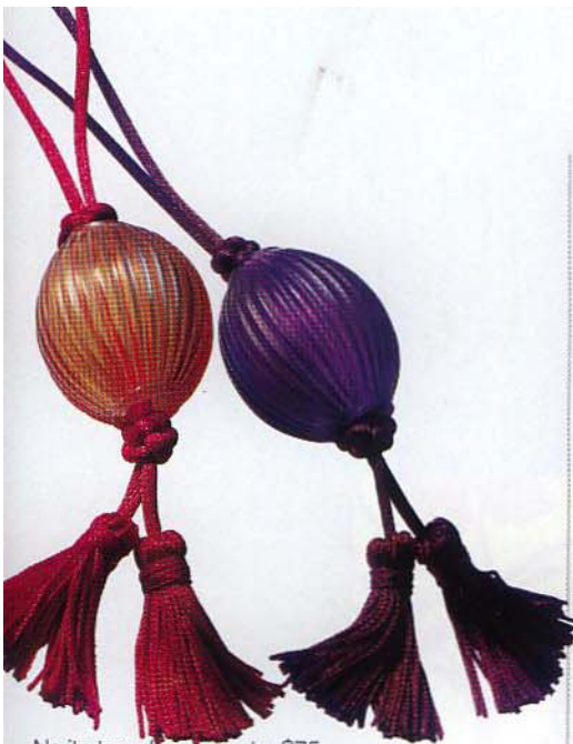
Nerita tassel ornaments, $75 each, at Lalique , Bal Harbour