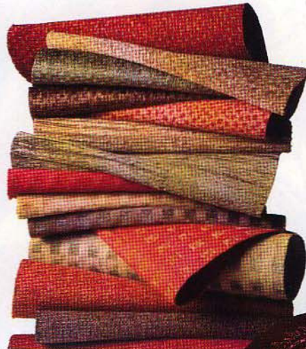
Assorted fabrics by Rodolph , at Jerry Pair , DCOTA, Suite B-170, Dania Beach