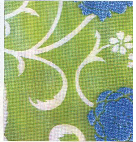
Aretha fabric by Chella Textiles , $304 per yard, at Jeffrey Michaels , DCOTA, Suite A-168, Dania Beach