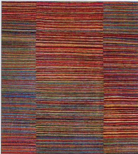
Contemporary hand-woven carpet, at Carpet Creations , Miami