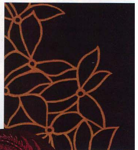
Phoenix carpet, at Niba , Miami