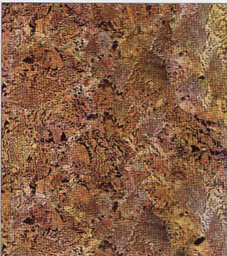
Graphic Feldspar semiprecious stone, at Keys Granite , DCOTA, Suite C-324, Dania Beach