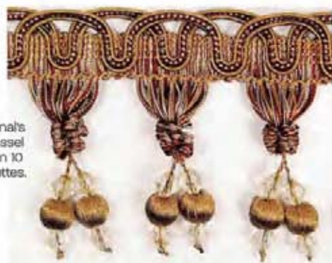
Expo International's Chelsea Ball Tassel Trim is offered in 10 multi-color palettes.

Chella Textiles offers San Marco, a Fortuny-inspired acanthus-and-vine design named for Venice's Piazza San Marco, home of The Fortuny Museum. Made with 100 percent recycled and recyclable polyolefin, the fabric is well-suited for use on small pillows, larger upholstered furniture and draperies indoors as well as outside. The San Marco is available in five colors: alabaster, raffia, moss, smoke and coco.