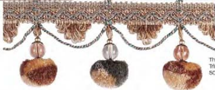
The Imagination Collection from Trimland includes 23 items in 50 color ways.